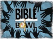
Practice today at 4:00