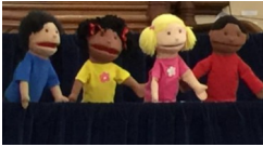
2nd-3rd grade team & 4th-5th grade team Practice today at 3:30